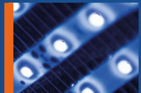
UVA/C LED AIR STERILIZER KIT