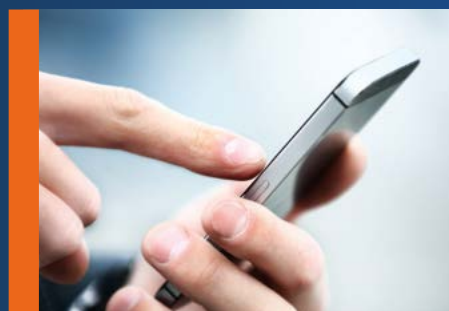
WI-FI MODULE WITH CONTROL APP